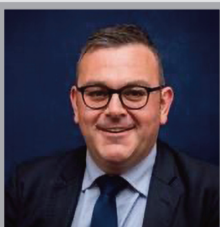
G. Hughes County Borough Councillor